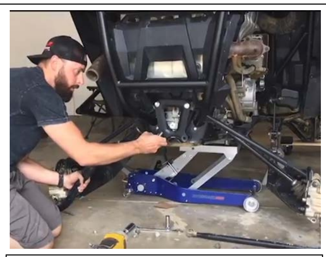
Position the radius rod in between the plate and the spacer, and slide the provided flange bolt into place. Secure it with the provided nyloc nut. Repeat on the other side.

Attach the other side of the radius rod to the spindle. Insert the same bolt that you took out in the same direction as you removed it, slide it in in the direction of the front of the vehicle. The washer and nut will go towards the back of the vehicle. Repeat on the other side. Torque all bolts to 79 ft lbs. (For 2016 and older models, use the additional OEM hardware purchased from Polaris instead)