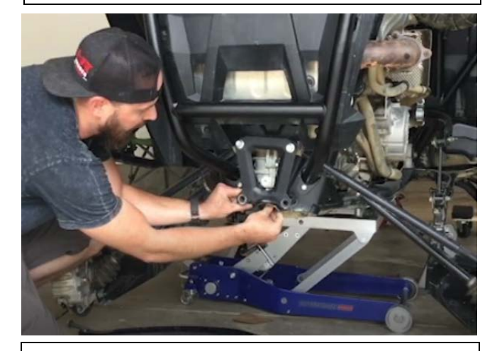
Insert the "U" shaped spacer bracket in between the frame and the plate. The flat part should be facing down, making it appear as a "U" if installed