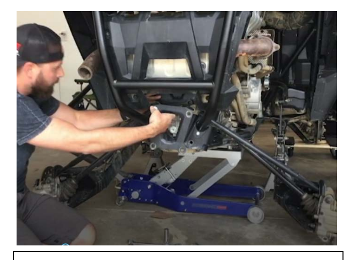
Reattach the plate using two of the provided flange bolts and nylon lock nuts at the upper two mounts, securing the upper radius rods with the bracket. (For 2016 and older models, use the M10 x 1.75 x 80)