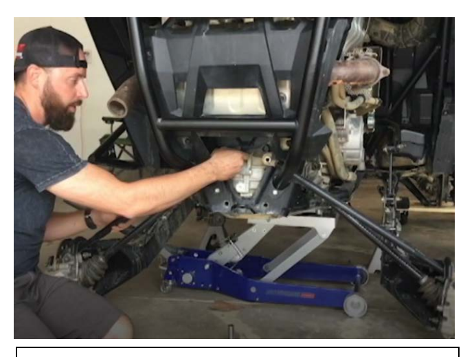
Take the straight spacer bracket and place it in between the frame and upper radius rods and the mounting point.